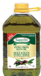
Saporito EVO Spain 3.00L