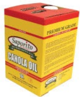
Canola 16L JIB