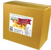
Fish & Chip Shortening 20kg