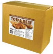
TOTAL BEEF® 20kg