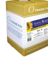
TOTAL SUN® 16L 100% Mid Oleic Sun