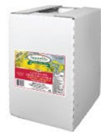
Canola Oil No Additives 16L