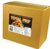
TOTAL FRY® Shortening 20kg