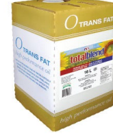
TOTAL BLEND® 16L 50% Mid Oleic Sun / 50% Canola