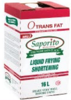
Liquid Vegetable Shortening 16L