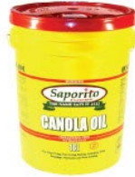
Canola Oil 16L Pail