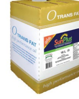
SunPlus 16L 100% Hi Oleic Sun