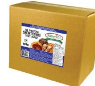
All Purpose 20kg